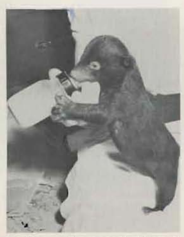
At the age of two months, "Kae-sei" had grown to 20 inches and seven pounds, six ounces and had sprouted teeth.

This bright-faced Eland was born on February 12. She was joined by another baby, a male, on March 14.