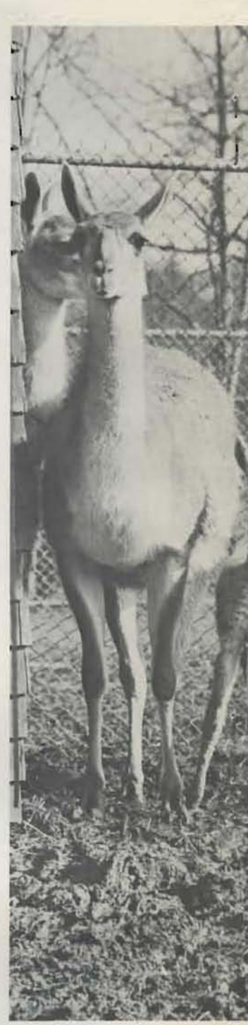
Two female Guanacos were be ary 23, to two different moth jasic—Plain Dealer.