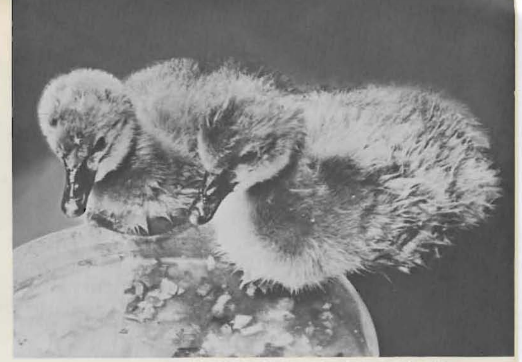
A pair of Black Swan cygnets was hatched in the Bird Building's incubator on February 3. Gray at birth, the swans gradually lose their fluff and get black feathers.