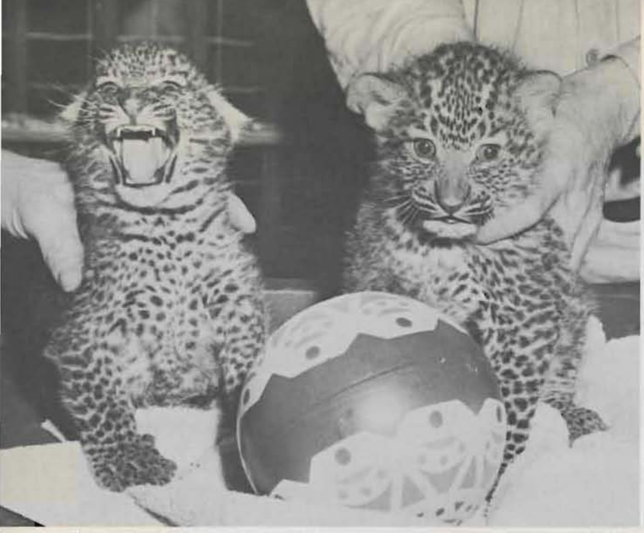
The pair of male leopard cubs were born to "Squeaky" and her male consort, "Toughie," on January 15, 1961.

Spring being a season of rebirth and hope, it is appropriate that we have a crop of new babies on display for the delight and pleasure of visitors, both young and old.